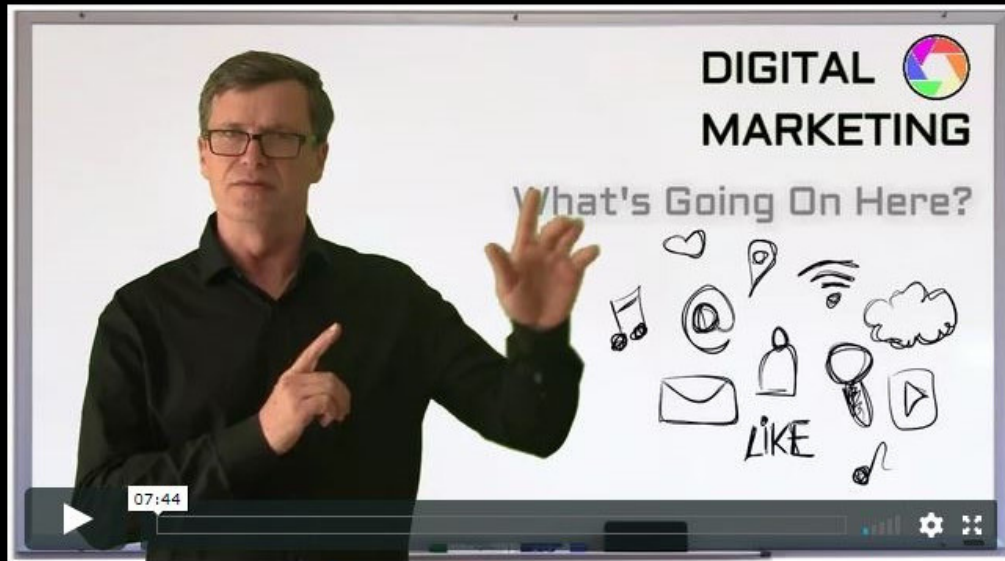
8 Hours of Video Lectures (65+ videos)